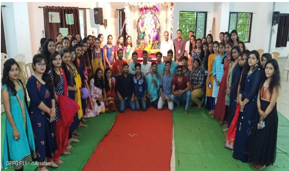
Celebration of Ganesh Festival