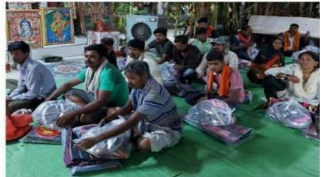
HelpAge hand to Labourers of Beltarodi Fire Disaster