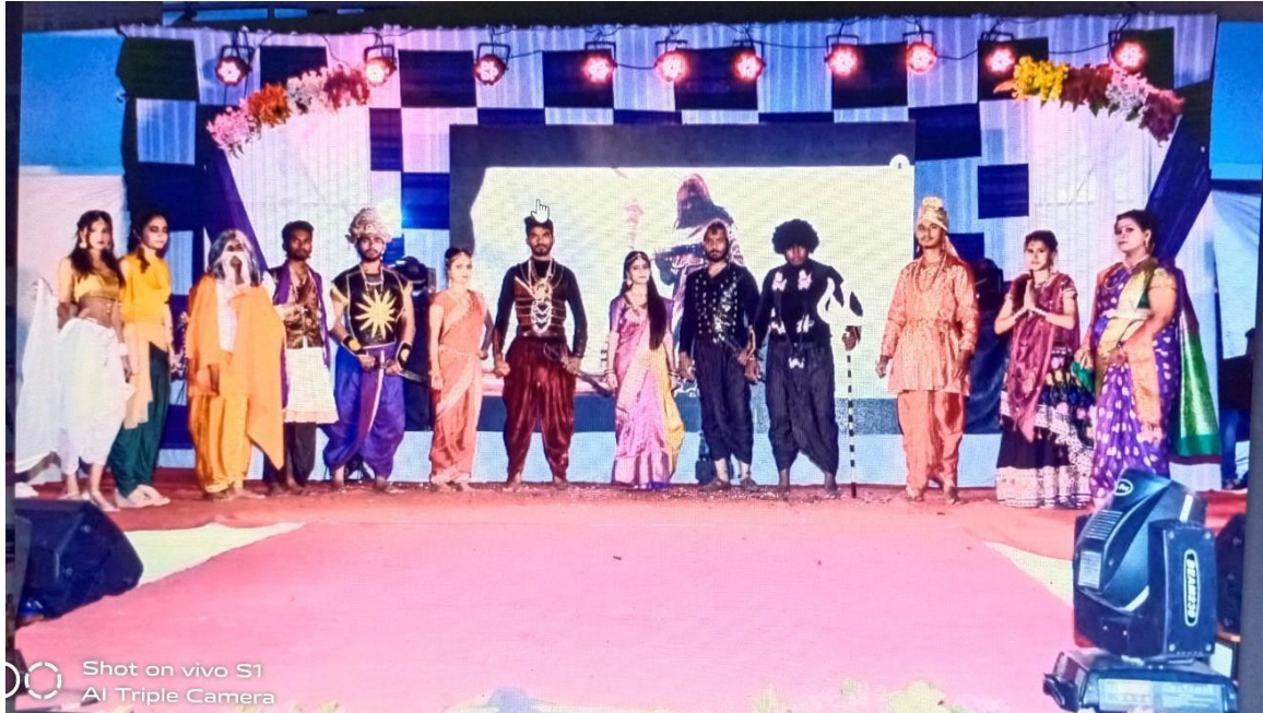
Performance of students in Annual Social Gathering Amrutum