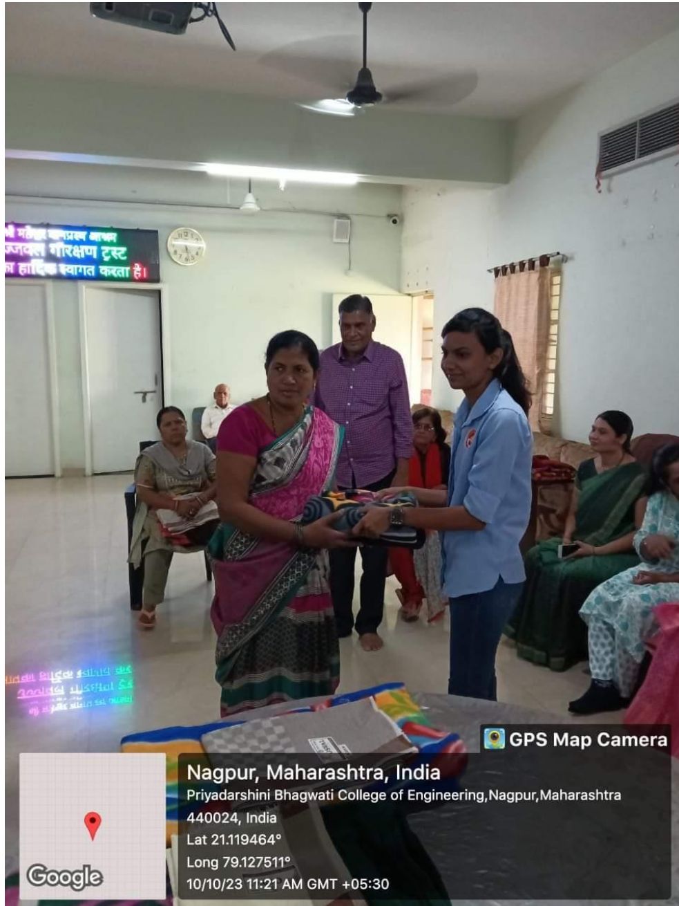
Distribution of Blanket to Vrudhashram